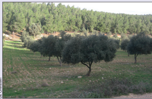
Figure 4. An olive grove surrounded by pine plantations north of Be’er Sheva, Israel. Land-use changes in the northern Negev Desert have augmented some ecosystem services, like carbon sequestration, food production, water infiltration, and recreational opportunities, but impacts on other services, such as aesthetics and habitat for biodiversity, are more equivocal.