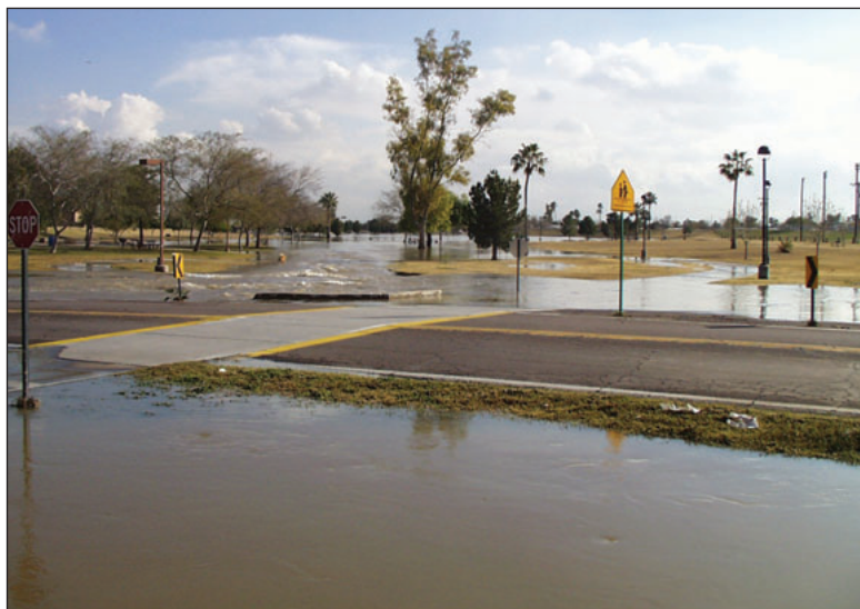
Figure 2. Indian Bend Wash, Scottsdale, Arizona, during a flood that covered a large portion of the “greenway”; the flood spread out over parks, golf courses, and streets, but resulted in minimal damage. This design was one of the first non-structural flood management systems in the US, created by local and federal government officials after damaging floods occurred in the 1960s.

and are therefore often ignored in decision-making processes (Daily et al. 2009). Human behavioral decisions – from the individual to the institutional levels – affect ecosystem processes that in turn determine the quality and quantity of ecosystem services that influence human well-being. The concept of ecosystem services therefore constitutes the crucial link between natural capital and social capital in the PPD framework.