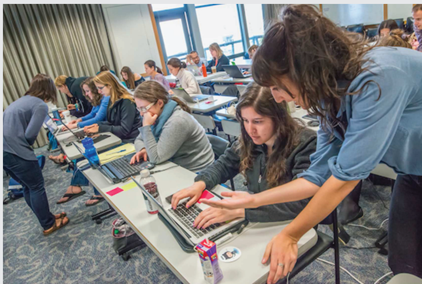
Figure 1. A Software Carpentry Boot Camp for Women at Lawrence Berkeley National Lab.